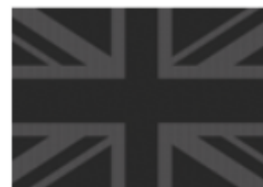
Softtop MINI Yours (3YR)