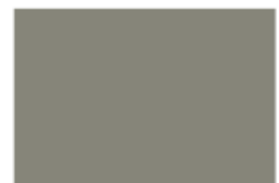
Melting Silver metallic