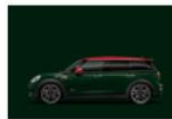
Rebel Green uni