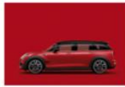
Chili Red uni