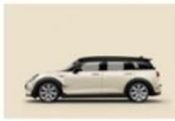
Pepper White uni