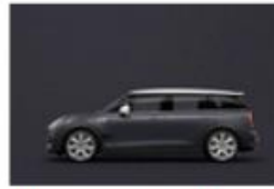
Thunder Grey metallic