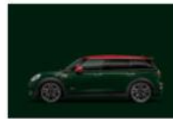
Rebel Green uni