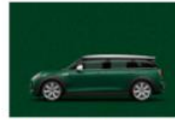
British Racing Green metallic