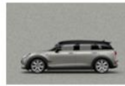
Melting Silver metallic