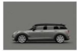
Moonwalk Grey metallic