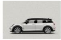
White Silver metallic