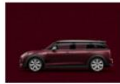
Pure Burgundy metallic