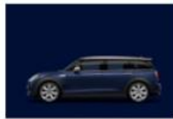
MINI Yours Lapisluxury Blue uni