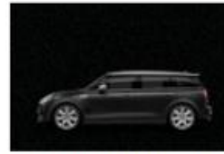
Midnight Black metallic